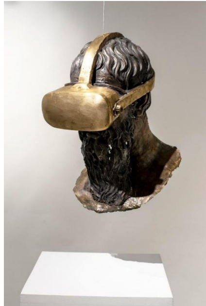
Plato's Cave: Metaverse, Javier Blanco, 2023. Source: Javier Blanco

Algorithms decide for themselves what they will show us today on the feed. And all the trendy videos we see are not based on luck. They are all the result of math calculations based upon user behavior data such as clicks, views (and the length thereof), and likes."